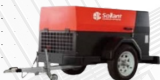
Diesel Portable Compressor