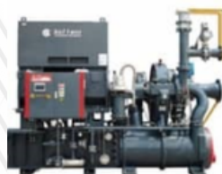
Centrifugal Turbo Compressor