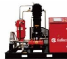
Oil-Free Screw Compressor