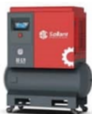
Single Phase Screw Compressor