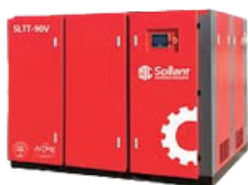
Two-Stage PM VSSD